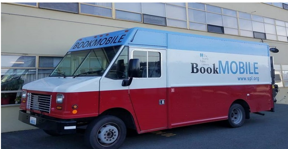
Above: The Bookmobile arrives! Residents excitedly await their newest favorite book or movie!

The Bookmobile brings stories, entertainment, ideas, information, and more to Norse Home each and every month. Have a special request? Are you an audio book connoisseur? We've got you covered! Norse Home believes that a happy life is a life filled with curiosity, creativity, and learning. Where will your mind travel next?