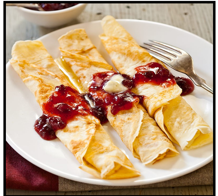
Above: The Norse Home kitchen staff work hard to create what we think are the best Swedish pancakes in the Pacific Northwest! Give us the chance to convince you on April 15th!